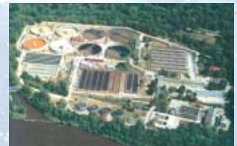
Waste water treatment plant

Our network of scientific institutes and companies experienced in different disciplines offers a wide range of services and provides tailor-made sustainable solutions in the field of water management, extending from feasibility studies, design of water supply systems, public-private operation models up to waste water treatment.