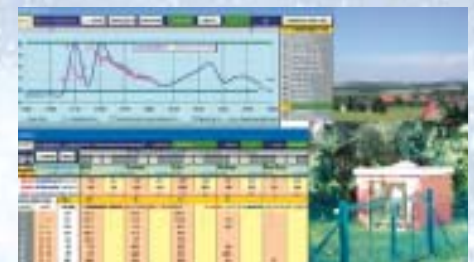
Geological data analysis